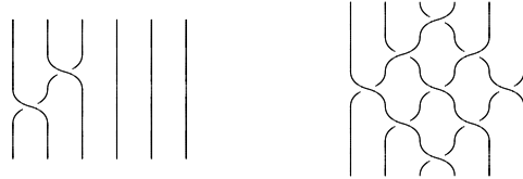
Figure 1: The braids \rho_0 and \rho_1 , for p = 3

Proposition 5.3 The braid monodromy \eta : G(\mathcal{B}) \rightarrow P_{2p} of the fiber bundle M(\mathcal{A}_p) \rightarrow M(\mathcal{B}) is given by \eta(\gamma_j) = Z_j , \eta(\gamma_{12:r}) = A_{1,2}^{(r)} .